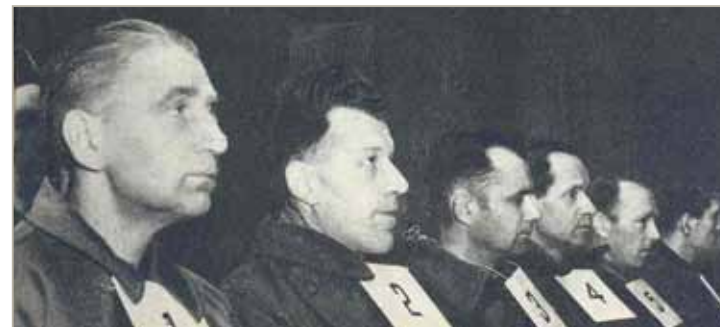
Defendants at the first Curio-Haus Trial in 1946.