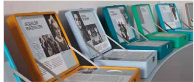
Symbolic suitcases for the children in the exhibition, 2011.

In addition to the material shown in the new permanent exhibition, artistic treatments of the Bullenhuser Damm murders play an important role at the memorial. The large wall painting by Jürgen Waller entitled "21 April 1945, 5:00 a.m.", for instance, is an important point of reference for the memorial's educational work. Visitors can plant roses in memory of the victims in the