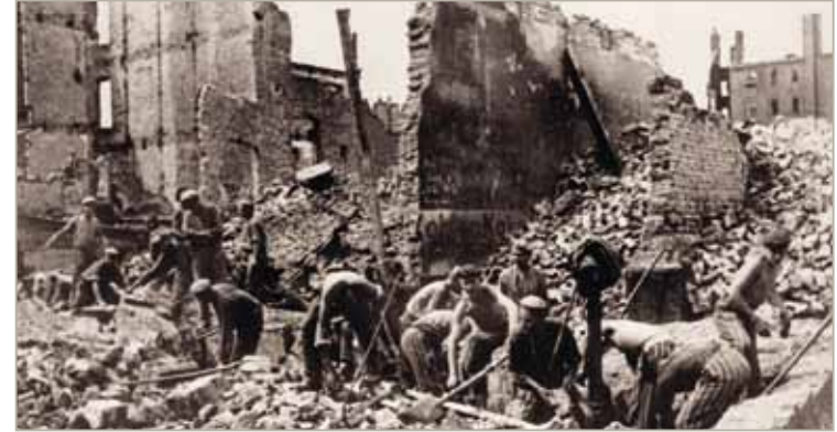
Prisoners on clearance detail in Hamburg in 1943.

comply with forced labour orders or on racist grounds. Current research into prisoner numbers states that more than 80,000 men and 13,500 women were registered at the Neuengamme concentration camp, while another 5,900 prisoners were either never entered into the camp's files or registered separately. In total, at least 42,900 people died in Neuengamme itself, in one of its satellite camps or in the course of the camp's evacuation. From 1942, the German Ministry of Armaments and the country's armaments industry increasingly demanded concentration camp prisoners as cheap labour. This prompted the establishment of a large number of satellite camps. More than 85 satellite camps of Neuengamme were established all