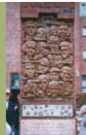
■■■ Main exhibition at the Neuengamme Concentration Camp Memorial in 2010.