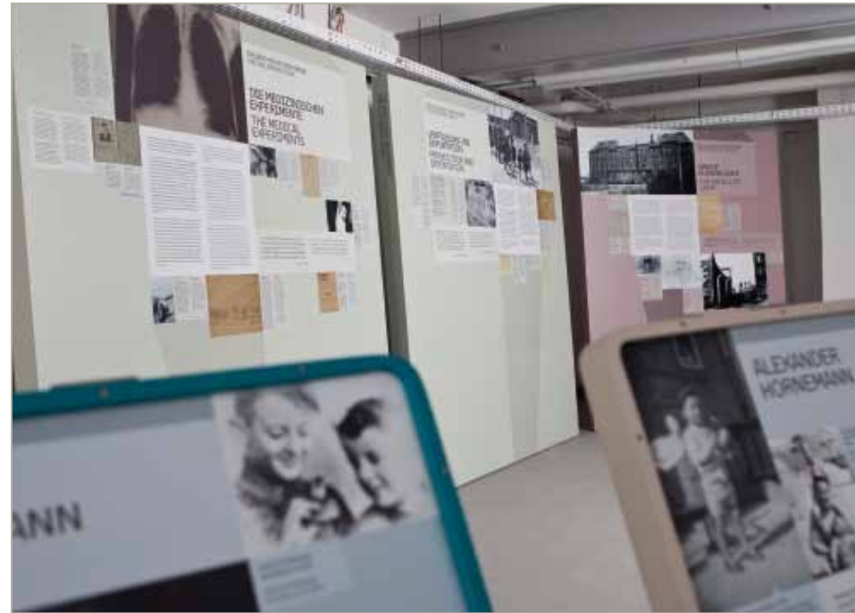
View of the exhibition in 2011.