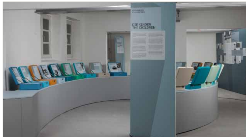
Suitcases containing biographical information on the children and their families, 2011.

projects can be arranged for school and youth groups. Students are also given the opportunity to exhibit their own artworks or projects on the subject at the Bullenhuser Damm Memorial.