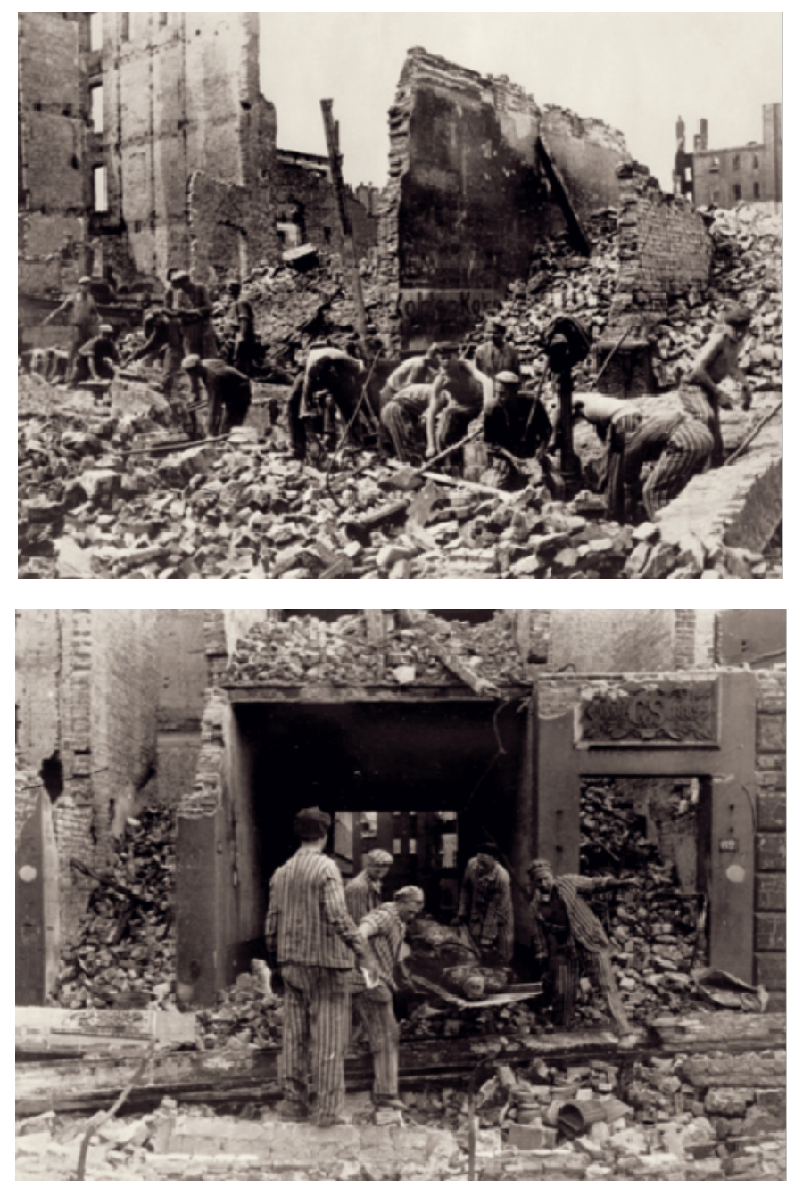
Prisoners on clearance detail in the bombedout Hammerbrook area of Hamburg in 1943.