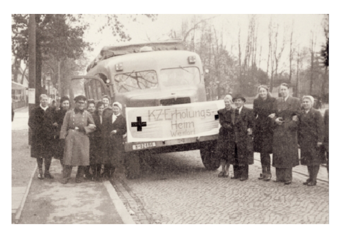
The "Committee of Former Political Prisoners" set up sanatoriums for concentration camp survivors and children's homes in Hamburg and the surrounding area.