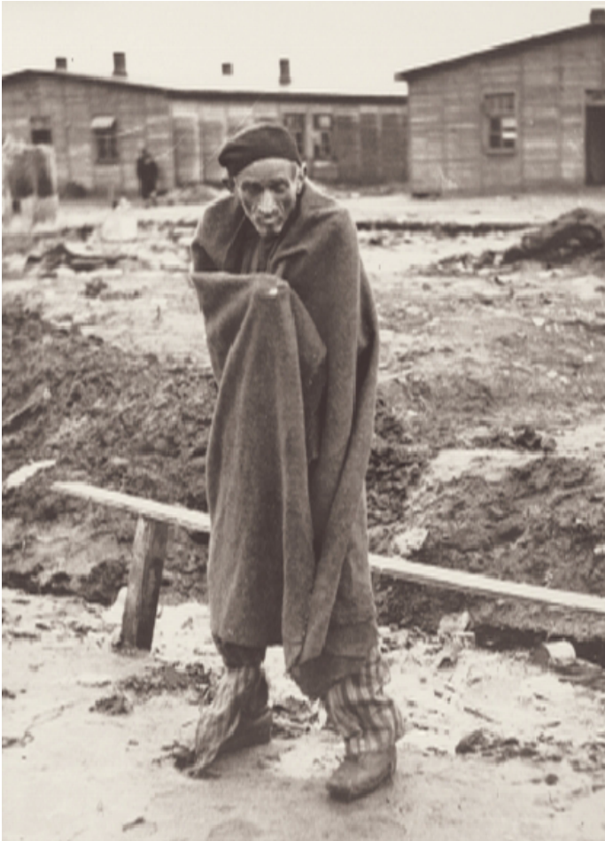
Sandbostel, 30 April 1945 – just barely escaped death.